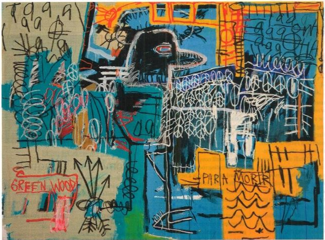
Bird on Money by Jean-Michel Basquiat

OCTOBER 2016 /// A GUIDE TO WHAT'S HAPPENING NOW IN YOUR NEIGHBORHOOD